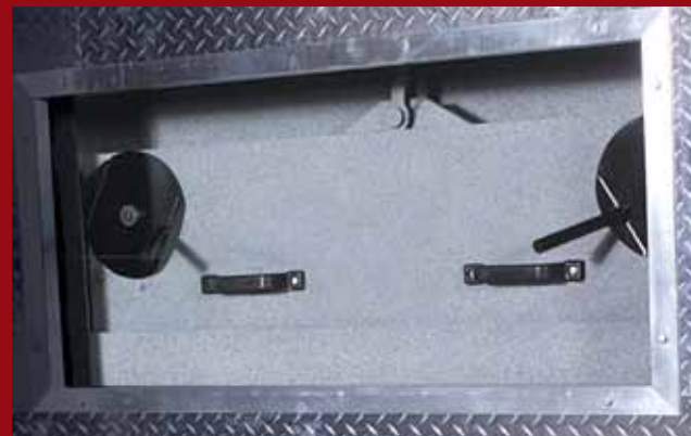
Optional rear clean-out available.