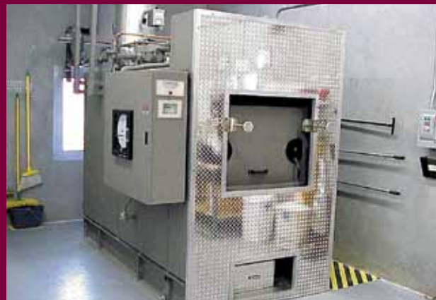
Shown with Automatic Hydraulic Door System

The Power-Pak Jr. is pre-wired, pre-piped, and pre-tested before shipment, requiring only off-loading, one connection each for gas and electricity and placement of the stack we provide.